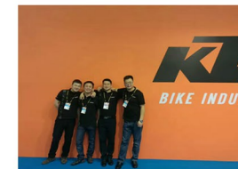
Research & Development